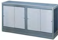
600102 - Exhibit, Counter, 2M x 1/2M x 40"H