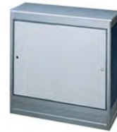
600101 - Exhibit, Counter, 1M x 1/2M x 40"H