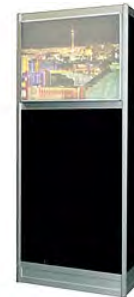
600223 - Exhibit, Light Box, Small 37"x28"