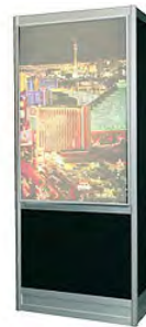
600222 - Exhibit, Light Box, Medium 37"x56"