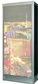
600221 - Exhibit, Light Box, Large 37"x85"