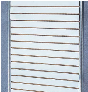
661931 - Exhibit, Panel, Slatwall, 1M x 8'