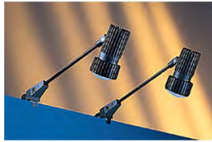
600110 - Exhibit, Armlight Black