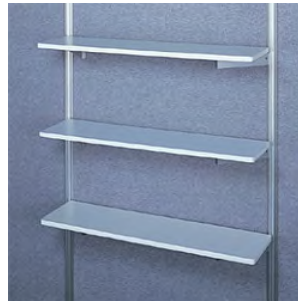
600243 - Exhibit, Shelf, 1M x 10" Deep