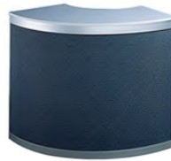
600103 - Exhibit, Counter, 1M Curved