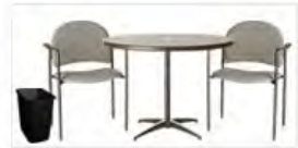
Chair Package A