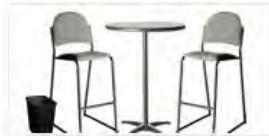
Stool Package A