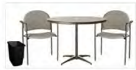
Chair Package A