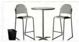
Stool Package A